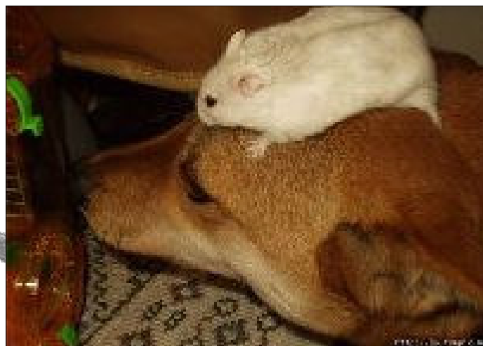
Take time to enjoy the company of friends